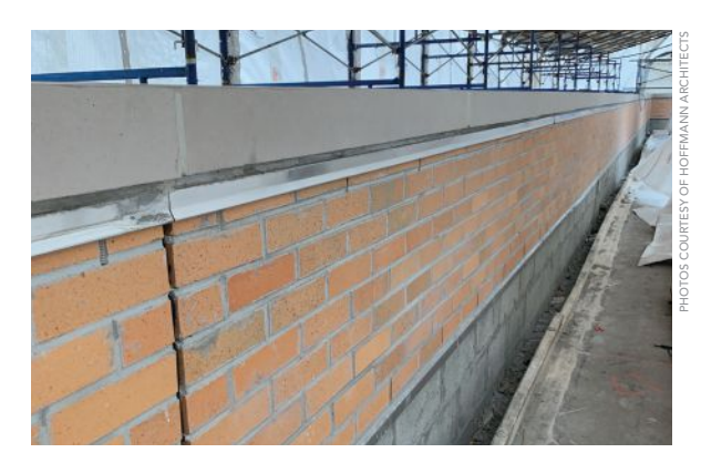
With the copings and flashing in place, the parapet is nearly complete.