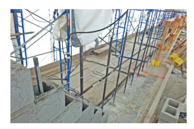
Steel bars reinforce the concrete masonry unit core of the new parapet.

A continuous vapor barrier behind the exterior cladding of the parapet should provide a clear drainage plane that redirects water away from the building and allows moisture in the form of vapor to escape from the interior. Typically, the vapor barrier encapsulates the top of the parapet wall directly underneath the coping, transitioning along the vertical face of the wall, and down onto the horizontal face of the roof level. Self-adhered and liquid-applied air and vapor barrier systems prevent moisture from traveling beneath the membrane, providing an additional waterproofing redundancy while also allowing the wall assembly to