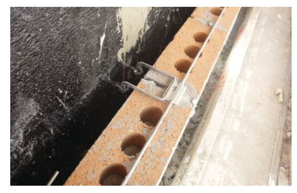
Brick ties anchor the cladding to the CMU structural core.