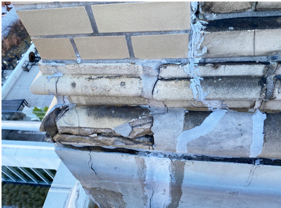
▲ Unsafe conditions demand immediate attention.

As with the sleeve of a letter, the envelope of a built structure protects the elements within and creates a boundary between "inside" and "outside." The foundation provides the structural base and serves as the border between earth and building, transitioning to the facade , or outer walls. Windows, doors, louvers, and other fenestration create a permeable barrier that modulates the passage of light, air, moisture, heat, sound, and occupants. Capping the enclosure are roofs and terraces , which provide weather protection,