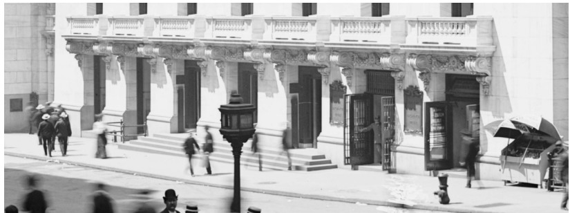
▲ Historical photograph of the doors to the New York Stock Exchange (NYSE) in 1904.

Although treatment to buildings with historic designations may follow a stringent set of guidelines that doesn't pertain to newer structures, these older buildings typically are not exempt from current accessibility and life safety codes. The challenge is to meet applicable code requirements while minimally impacting – and preserving – defining features and spaces. ■