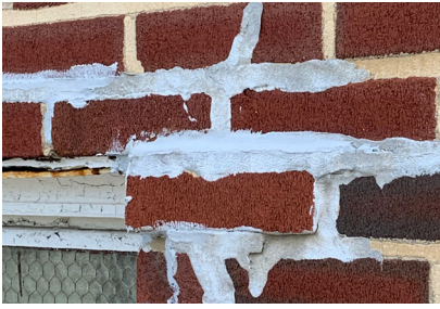
▲ Slapdash repairs can make problems worse.

hold mechanical equipment, and may offer amenity space.