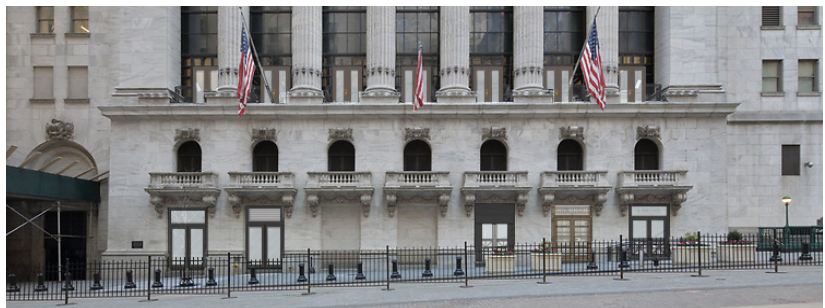
▲ NYSE door design options proposed to the NYC Landmarks Preservation Commission.