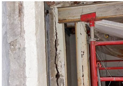
▲ Stabilizing beams until permanent repairs.

option for delay. Costs to immediately stabilize a hazardous condition or erect the necessary site protection are a given. Loose slate shingles on aged roofs or cracked and deteriorated terra cotta on older buildings can become dislodged and fall off with little to no warning. Even on newer buildings, faulty components, such as an insecure terrace railing, can pose a danger to an unsuspecting user.