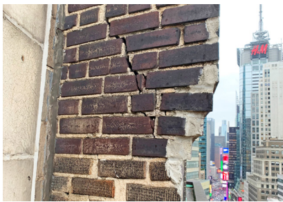
▲ As maintenance is deferred, cracks and spalls proliferate into emergency hazards.

Some owners opt to address deterioration in areas accessed by the public first, leaving private spaces for later phases. For example, a leak in an arena that hosts sporting events will take precedence over a leak in the athletic offices, not only because of the risk of damage to an expensive gym floor, but also because games are high-profile – and revenue-producing – events.