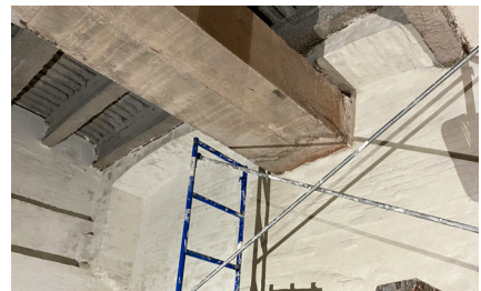
▲ Positive-side foundation waterproofing (left) is exterior; negative-side (right) is at the interior.