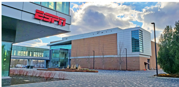
▲ ESPN Headquarters, Bristol, Conn., Roof Repairs & Replacement.

New London, Connecticut Campus-wide Enclosure Assessments and Prioritized Recommendations