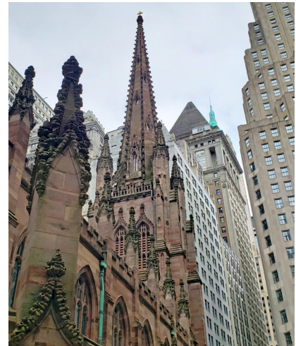
▲ Trinity Church Wall Street, New York, New York, Roof Consultation.

Office Building New York, New York Facade Replacement