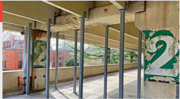
▲ Temporary shoring at a deteriorated garage beam.

With components that tend to be more utilitarian than those of a building enclosure, garages frequently require a less invasive and complicated scope of work when repairs are needed. Parking structures are often constructed primarily of concrete and, with routine maintenance, tend to have greater longevity than building enclosures. As the tragedy at Surfside underscored, however, that upkeep is key, along with oversight to see that construction adheres to specifications. ■