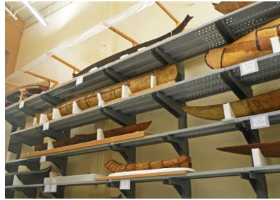
▲ Vulnerable artifacts must be protected.