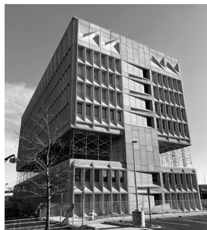
▲ Hotel Marcel (Pirelli Tire Building), New Haven, Connecticut, Building Enclosure and Roof System Consultation for Adaptive Reuse.

Hartford, Connecticut Roof Pedestrian Plaza Replacement