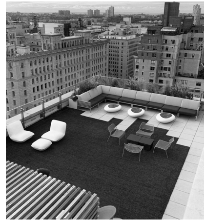
▲ 222 W80, New York, New York, Building Envelope and Roof Amenity Space Consultation.