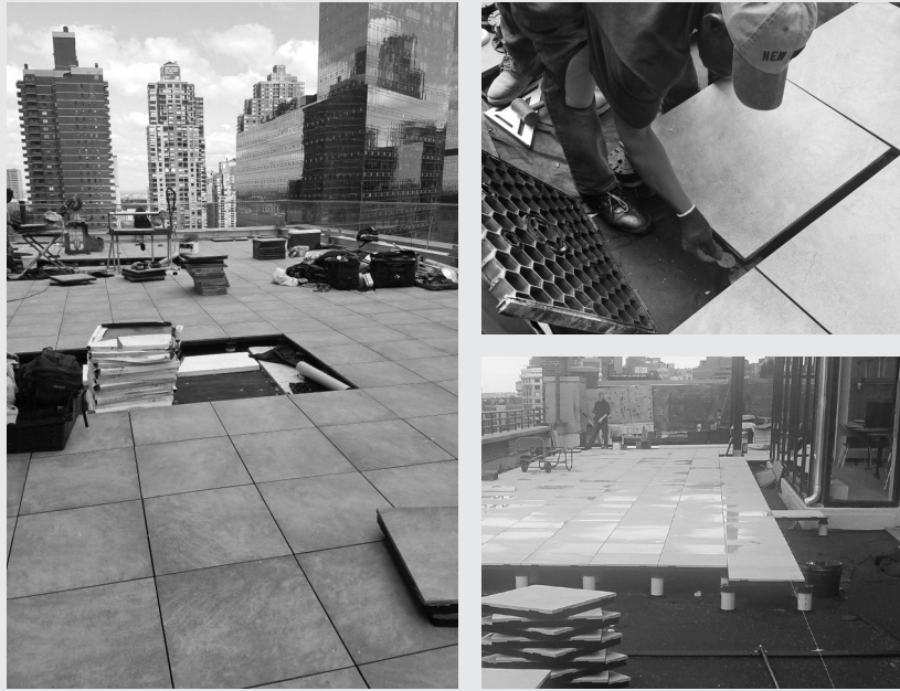
▲ Elevated paving units protect waterproofing and insulation with a level walking surface.

However, green roofs have some stigma in the construction and building management industry, mainly related to the perceived intensive upkeep, the tendency of plantings to wither and die off, and the initial startup costs. With a clear-eyed view of the available options and a diligent – although not necessarily laborious or expensive – routine maintenance program, an appropriately designed and correctly installed vegetative roof need not be as costly or as demanding as it might seem.