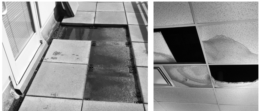
▲ If a leak does occur in a paver roof assembly, it can be hard to detect, especially if water remains below the surface. Sometimes, it is only noticeable after damaging spaces below.

There are products available to alleviate the process of chasing down a leak. Electronic leak detection systems, such as vector mapping, introduce a low voltage to the dampened roof membrane to pinpoint the location of a leak. However, for accurate results, exposure of the waterproofing membrane by temporarily removing the overburden assembly is recommended. Electronic leak detection also can be used immediately after repairs are performed to confirm that the leak was completely resolved. ■