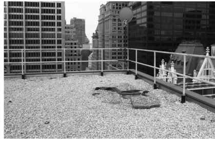
▲ For non-accessible roofs, pavers create a clean look (right) and improve safety over ballasted systems (left).

Porcelain. Porcelain tiles are an increasingly popular choice for finished roofs due to their aesthetic appeal and long-term performance. Manufactured in a slimmer profile than concrete at around \frac{3}{4} " thick, porcelain pavers are lighter, and therefore easier to transport and install. However, because of their light weight, porcelain pavers have more limitations in terms of the assembly and are best used in a pedestal or tray system. Porcelain is also completely nonporous, and therefore