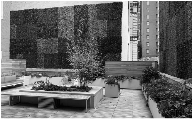
▲ Green elements, like these living walls and planters, are visually striking while serving to improve air quality and stormwater management.