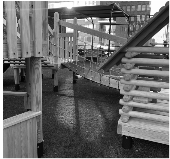
▲ Cushioned synthetic turf surfacing and climbing equipment converts this urban church rooftop into a playground oasis.

There are two methods for determining roof wind uplift for a specific building: wind tunnel testing or calculations based on the American Society of Civil Engineers' ASCE 7 Minimum Design Loads and Associated Criteria for Buildings and Other Structures . Wind tunnel testing involves constructing a scale model of the existing or proposed building and the surrounding structures on a turntable. The turntable is placed inside a wind tunnel that simulates the characteristics of natural wind, and the turntable allows the scale