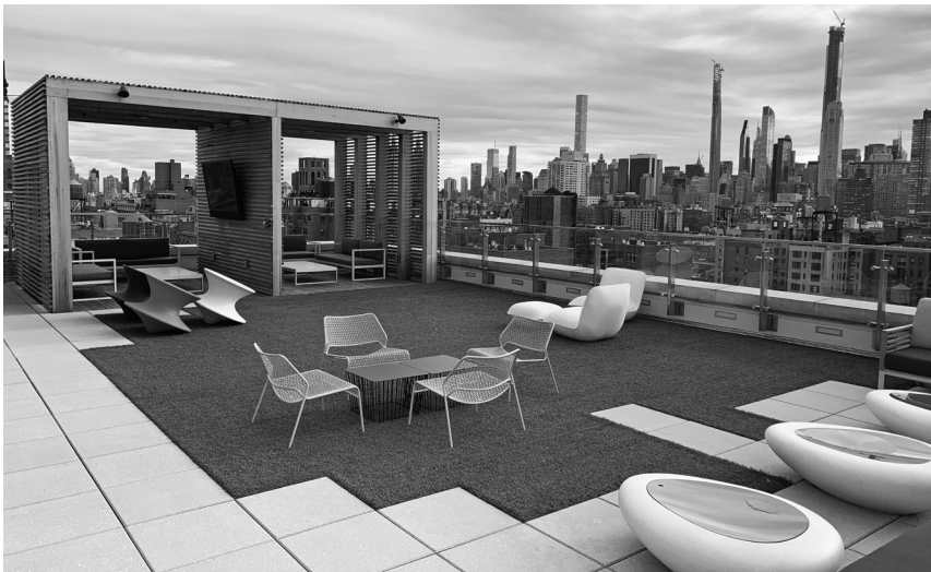
▲ Incorporating an outdoor recreation area into a roof capitalizes on existing space and creates a desirable building feature. A blend of pavers and turf creates a dynamic feel to this terrace.

The COVID-19 pandemic has laid bare shortcomings that a lot of American cities struggle with, when access to outdoor spaces is not only an amenity, but a necessity. For those fortunate enough to live in a building that provides outdoor space, the decision to stay home was made all that much easier. As the availability of vaccinations and evolving health guidelines allowed people to resume gatherings outside, demand for open-air facilities