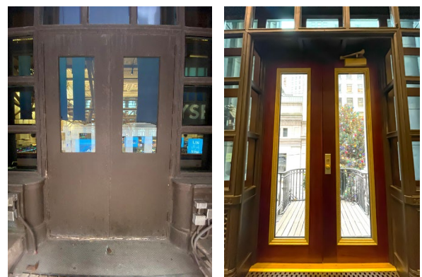
Existing steel balcony doors [left] were utilitarian; replacement solid mahogany French doors restore light and character.

Many of the 1920s wood doors at the ground floor were sufficiently sound to permit retention and restoration. An existing historically accurate metal-and-glass door was also restored. At infill areas where interior configurations did not permit refitting of doors, the project team restored bluestone and removed architecturally incongruous artifacts such as steel fences and grilles. New steps and pavers match the color, texture, and appearance of the originals while enhancing resilience at high-traffic entrances.