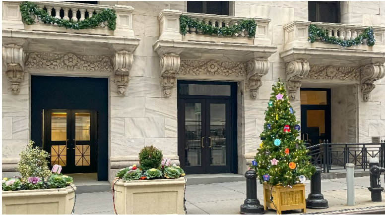
Restored and replacement entry doors at the NYSE Statuary Building.

French-style solid wood doors had been replaced with steel, the erstwhile large glass lights pared down to small openings. While this modification provided peace of mind against potential terror attacks, it diminished natural light and architectural richness.