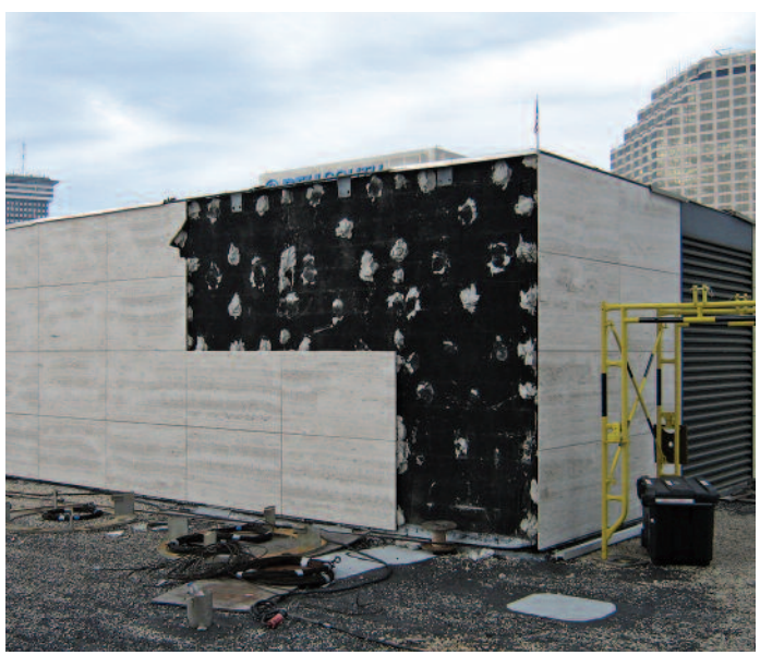
Penthouse marble panel replacement in process.

Thinner marble lacks the strength to resist intrinsic material stresses. Through a process known as hysteresis , some fine-grained marble veneers gradually expand with