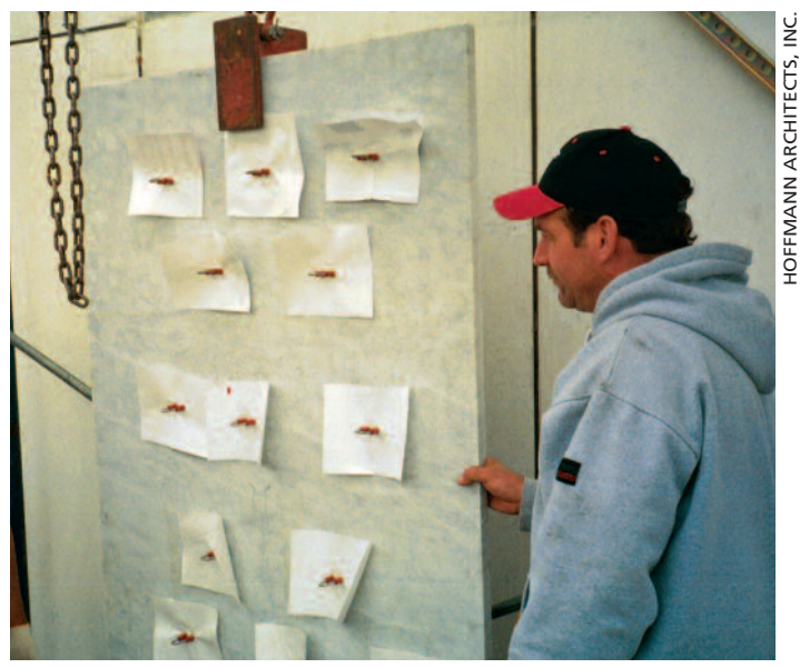
Replacement panel mock-up to assess anchor geometry and installation protocol.