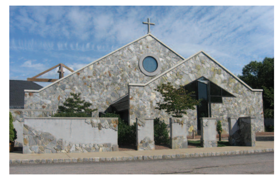
Exterior rehabilitation of this chapel addressed water infiltration, rust staining, sealant deterioration, and other problems at the thin-stone-veneer facade.