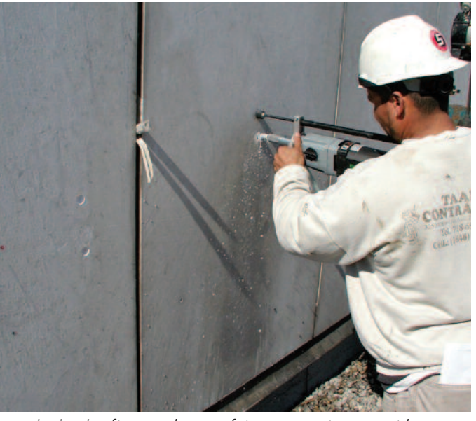
Face-pinning is often used as a safety measure to prevent loose panels from falling.

• Petrographic analysis (American Society of Testing and Materials/ASTM C1721) describes the nature of the stone as regards its lithology, mineralogy, morphology, microstructure, and aging. Petrography enables classification of the marble, and assists in the detection of defects.