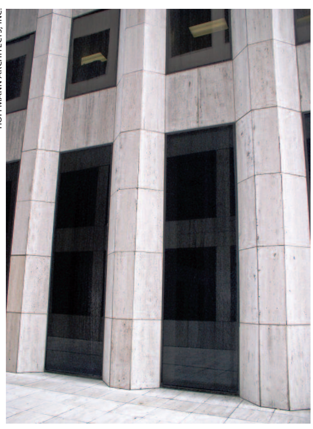
New stone-cutting technology permits thinner marble panels—and brings new design challenges.

Hundreds of different types of marble are found throughout the world, including the United States, Europe, Egypt, and India. Characteristic veins and gradations in color