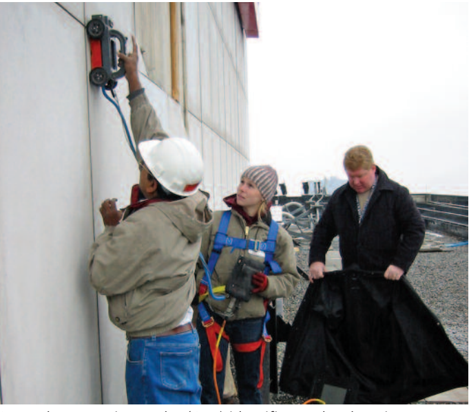
Ground-Penetrating Radar (GPR) identifies anchor locations without removing panels.

Hand-set panels may employ anchors inserted into kerfs —which are narrow slots at panel ends—or fasteners set in holes at the sides or rear of the panel. Care must be taken during fabrication to cut kerfs and holes neither too deep nor too shallow, so that they are large enough to hold the anchor, but not so large as to weaken the marble panel. Incorrect placement too near the edge of the panel can cause breakage.