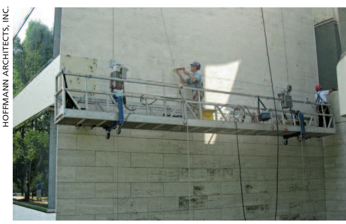
Periodic sealant replacement should be part of a comprehensive maintenance program.

Larger, continuous cracks should be evaluated on a caseby-case basis. Usually, face-pinning the stone and patching