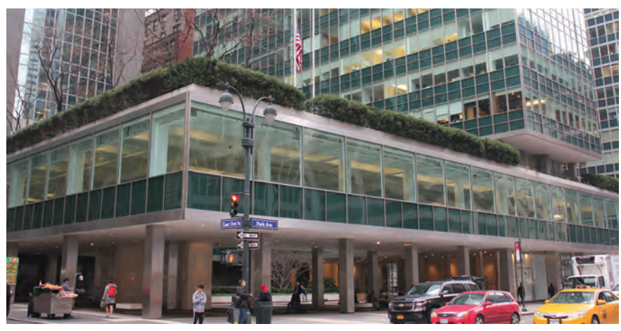
PHOTO 3: A modernist hardscape is internalized and removed from the street plane at Lever House, 390 Park Avenue, New York.

Alternatively, the 2015 IECC does allow exemption for historic buildings if the code "would threaten, degrade, or destroy the historic form, fabric, or function of the building."