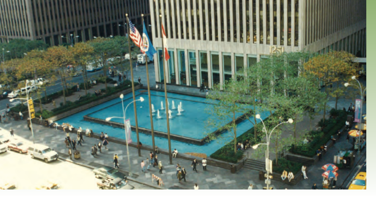
PHOTO 1: The horizontality typical of mid-20th century modernist plazas is expressed as a water feature at 1251 Avenue of the Americas, New York.