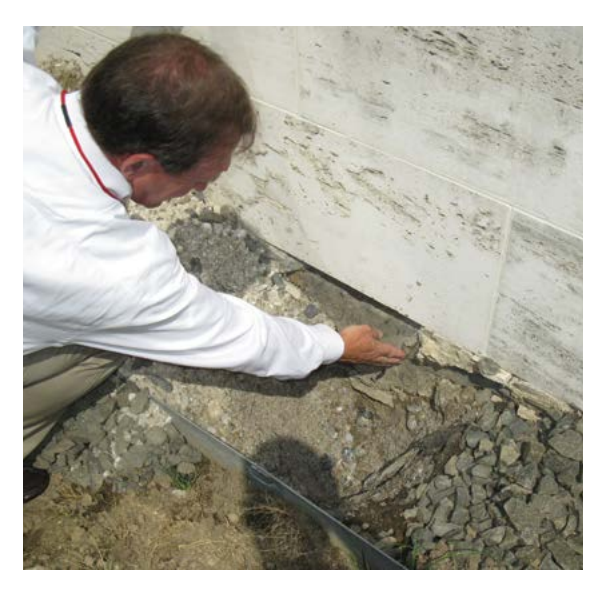
Visual assessment permits close observation of defects at exterior walls.

More general condition surveys might begin with a list of buildings included in the report, accompanied by an overall photograph and basic description of the type of construction and materials. For each building, a more in-depth data sheet could provide a description of each exterior envelope element, including design, construction, materials, and observed defects. Supplemental photographs included with the data sheets provide documentation of typical conditions, as well as highlighting any deficiencies or deterioration. If infrared photography was used or testing was undertaken, the images and results would also be included for each building.