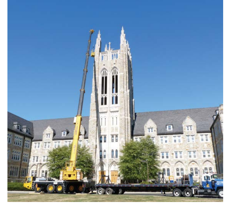
Close-up investigation may be aided by lifts, drops, or other observation platforms.

facility management priorities for both immediate needs and the long-term health of the facility.