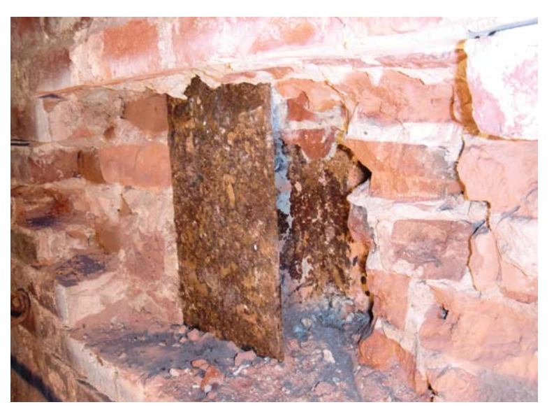
Invasive probes can reveal concealed problems, such as corroded structural steel.

Following the analysis of observed conditions and test results, the building envelope assessment report should provide prioritized recommendations for repair and rehabilitation, including construction cost estimates for each line item and total projected cost broken down by priority level. To facilitate planning and budgeting, a summary document listing any recommended repairs by building is helpful. The report should culminate in a checklist of repairs prioritized based on remaining useful life, organized according to an established timeline. For example, "Priority 1" might be within the next three years, "Priority 2" within the following three years, etc.