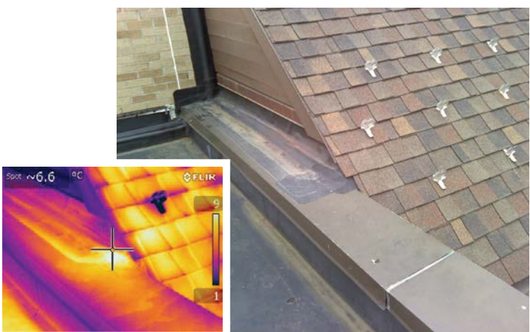
Infrared thermography photographs highlight areas of heat loss with color hues that represent thermal gradients.

the condition. Photography should be utilized extensively throughout the campus assessment. Not only will deteriorated conditions be documented, but a carefully planned photographic survey will also allow the architect or engineer, now back in the office, to evaluate found conditions. Overall photographs of each building elevation, accompanied by close-ups of details, can be transposed or keyed to building drawings.