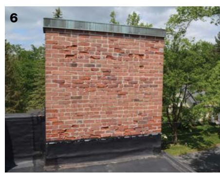
Sample conditions observed during a building envelope assessment of nearly 60 buildings on the urban university campus pictured on page 6 led to a long-range maintenance and rehabilitation master plan. Shown are examples of deteriorated roof membrane (1), displacement and fracture at stone facade (2), shattered glass-block windows (3), site wall and exterior stair damage (4), interior finish damage from roof leaks (5), and spalled brick masonry at a chimney (6).

To evaluate the performance of building envelope elements under different climate conditions, it is beneficial to conduct observational site visits at different times of the year. An investigation in the spring might pick up on cracked foundation walls that would be concealed by snow later in the year, but would miss ice damming or condensation only present during the winter.