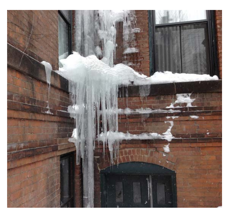
Conducting assessments in different seasons permits observation of varying weather-related conditions on multi-building campuses.

• roofs—with a walk-through for low-slope assemblies, including parapet walls, copings, flashings, and appurtenances like gutters, snow guards, and rooftop equipment;