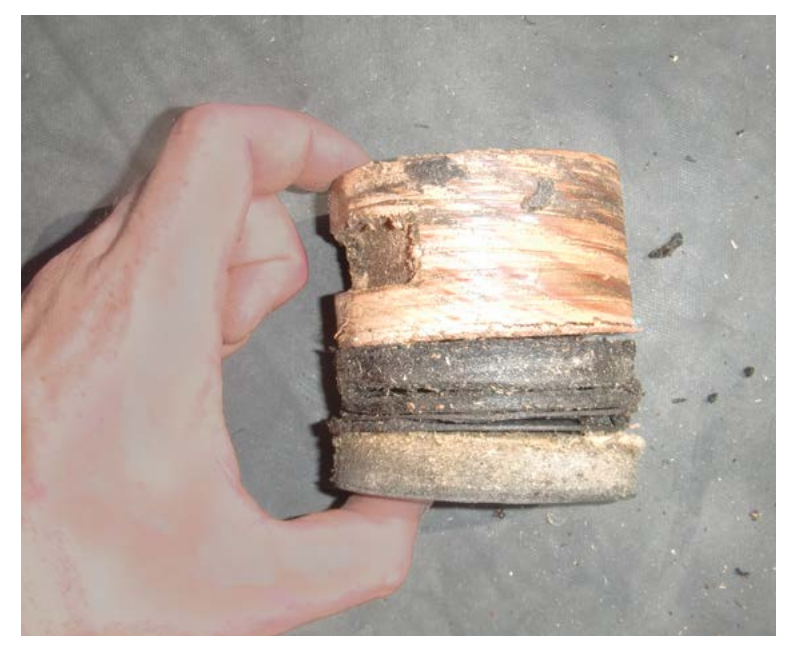
Test cores may be used to evaluate conditions within a roof assembly.

Implementing a water test, via a spray rack or even a garden hose, helps identify where and why an assembly or system leaks. Facilities personnel often deal with recurrent leaks in a particular building over a lengthy period. With a controlled water test, the source of those persistent problems may be identified within a few hours. Further, if indicated, the standardized procedures can measure the rate at which water and air infiltrate an assembly such as a window.