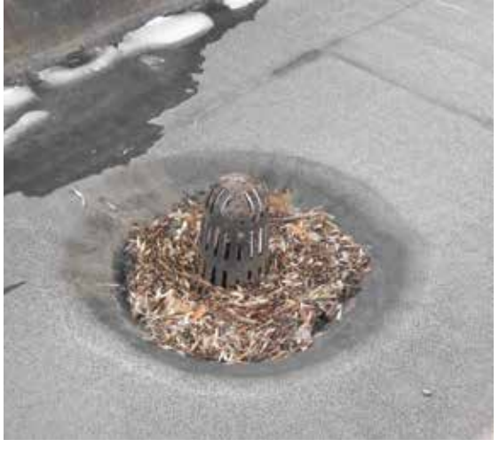
Regular inspections can prolong the life of a roof by identifying problems such as clogged gutters, which can lead to leaks below the roof and behind walls.