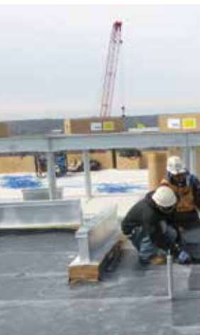
Roof design detailing must account for building-specific needs, such as the presence of many penetrations.

Flat roofs are not actually flat. This type of roof requires pitch to be built into the system to allow it to shed water. The minimum recommended pitch to provide adequate drainage is a quarter of an inch of rise per one foot of run. In order for flat or low-slope roofs to shed water, drains, scuppers, and gutters of sufficient size and number must be provided. A well-designed drainage system and properly pitched roof will prevent