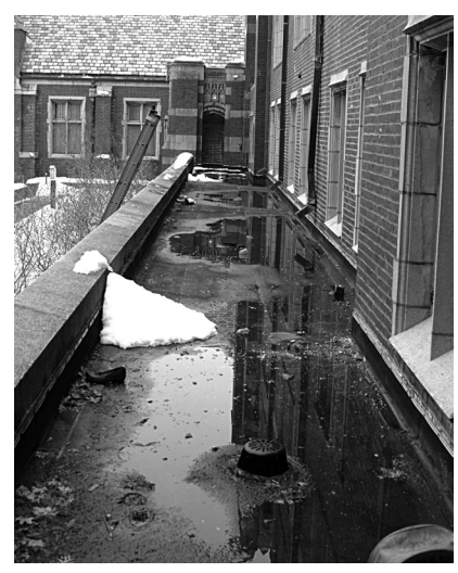
Ponding water on roof setback.