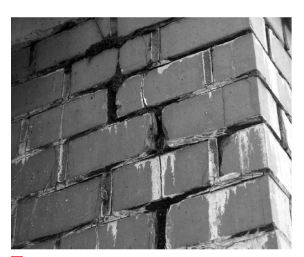
△ Cracks and eroded mortar compromise resistance to ice, snow, and changing temperatures.

Where is that water coming from? If you have ruled out drainage and water penetration problems, but large concrete members continue to show surface moisture, then you might have a simple case of seasonal condensation. Make observations during different weather conditions; condensation is likely to appear when weather heats up quickly, as during an unseasonably warm winter's day or early spring thaw. There may be little that can be done about the problem, however, as it is simply the nature of a large mass to warm up more slowly than the surrounding air, leading to water