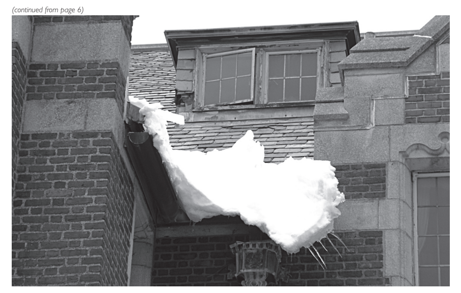
Ice dams pose serious hazards and, over time, lead to roof damage and leaks.