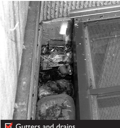
Gutters and drains