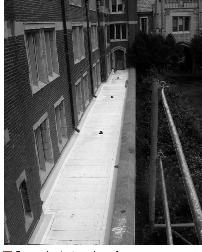
Properly designed roof.

Finally, work with a structural engineer to establish a roof snow management plan that will safely remove or redistribute snow such that no part of the