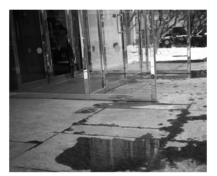
Fix drainage problems promptly, before icy patches create liability risks.

there, or to move it to a single area of the parking deck, which would then be closed to use. If the latter is the case, then be sure that the structure can accommodate the load of the mounded snow.