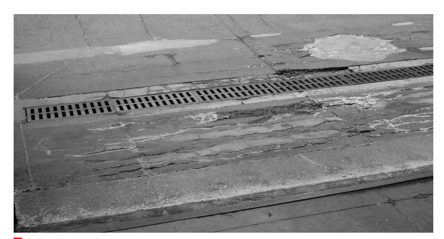
Steel plow blades can cause substantial damage, particularly at drains, joints, and transitions.

The best approach, then, is to stop this cycle of damage before it gets