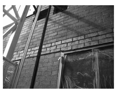
Reconstruction of brick exterior wall after flashing replacement.