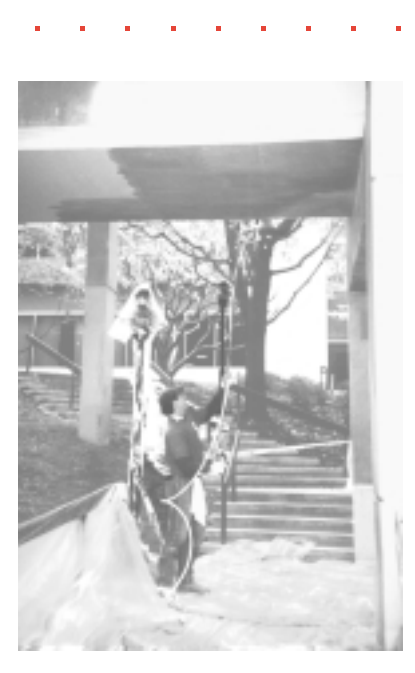
A worker spray-applies a breathable elastomeric coating to a concrete corporate facility.

Journal of architectural technology published by Hoffmann Architects, specialists in the rehabilitation of building exteriors.