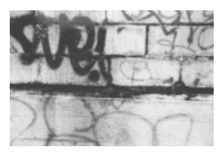
Two good reasons to use coatings: improved water repellency and ease of graffiti removal. Moss growing in joints is evidence of excessive moisture in the wall.

Anti-carbonation coatings are often used effectively to block the penetration of carbon dioxide into concrete structures. In order to allow moisture to escape, the coating should be breathable. Keep in mind that not all water-repellent coatings are anti-carbonation coatings and should not be used as such. Many do not form an effective carbon dioxide barrier. Use of an inappropriate coating may actually