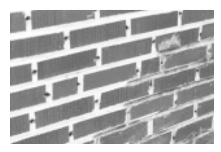
When the water repellent coating applied to this exterior brick wall trapped moisture inside, holes were drilled in an unsuccessful attempt to let water back out.

Other possible sources of water infiltration include old or weathered materials, poor original design or construction, and improper installation. By looking beyond the outward symptoms of the problem, the architect can develop a better, longterm solution to waterproofing issues.