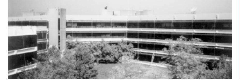
Prudential Eastern Operations Office Dresher, Pennsylvania (The Prudentatial Insurance Company of America)

Chase Manhattan Centre Wilmington, Delaware (Bassett Partners)