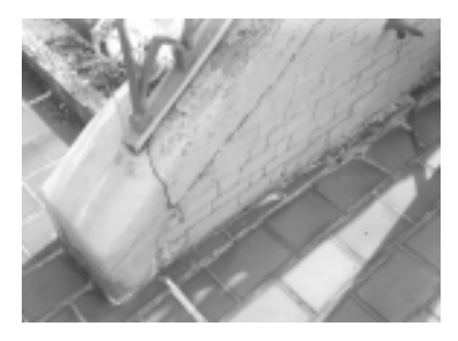
Even if masonry cracks are patched prior to coating application, the problem can recur unless the source of deterioration is also addressed.

accelerate carbonation by drying out the concrete enough to allow more rapid entry of carbon dioxide. As always, consult a design professional for specific coating guidelines, as each building has its individual needs.