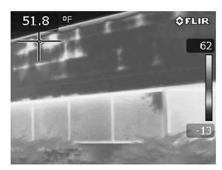
▲ This infrared thermographic scan reveals trapped moisture at insulation board joints.

To keep EIFS looking and performing its best, building owners should implement inspection and maintenance practices to address incipient problems promptly.