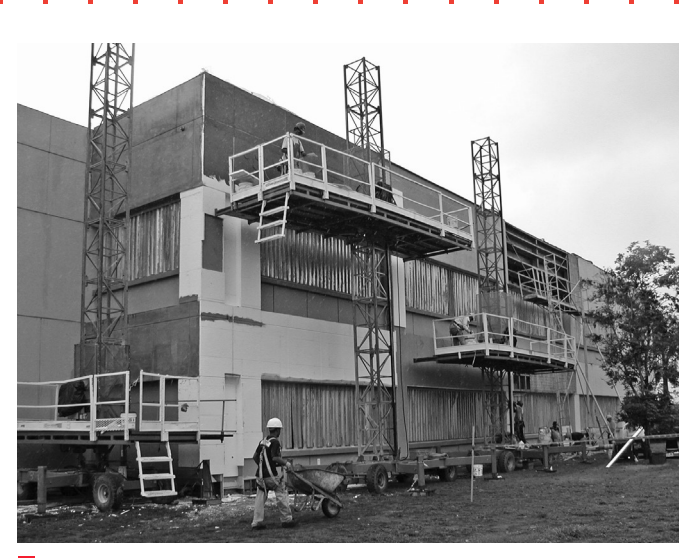
A For retrofit projects aiming to improve performance and update appearance, EIFS provides a practical option.

Exterior insulation and finish systems, or EIFS (pronounced "ee-fus" or "eefs"), are proprietary wall cladding assemblies that combine rigid insulation board with a water-resistant exterior coating. EIFS are popular chiefly for their low cost and high insulating