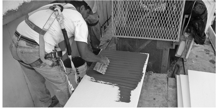
(continued from page 6)

For those concerned about the longterm viability of EIFS in light of the series of cladding failures in the 1990s, a 2006 study from the Oak Ridge National Laboratory (ORNL) should put those apprehensions to rest.