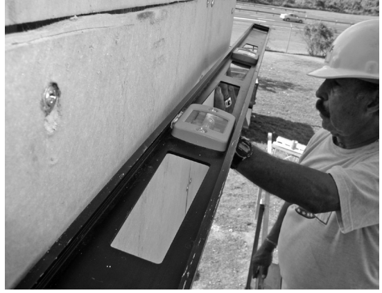
▲ To true the wall surface, the installer should level the insulation board, rather than build up base coat.

Wind load. Compared with mechanical attachment, adhesive attachment of EIFS board insulation has been demonstrated to provide superior wind load resistance. To achieve full design performance, the supporting construction must be free from damage, defects, and contamination before insulation is adhered. Sheathing must be capable of independently resisting anticipated wind loads.