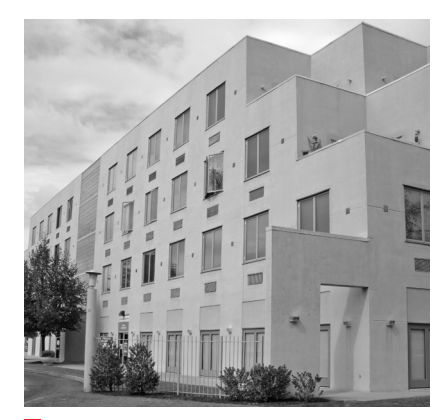
Windsway Condominium in Norwalk, Connecticut. Water Infiltration Investigation.

New Jersey City University Gilligan Student Union Jersey City, New Jersey Building Envelope Rehabilitation