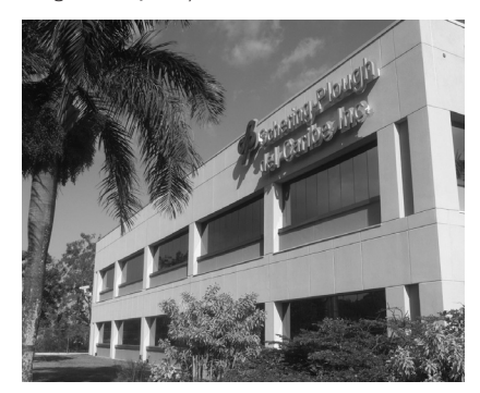
Schering-Plough del Caribe in Toa Baja, Puerto Rico. Facade Reconstruction.

Alexander Centre Princeton, New Jersey Building Envelope Rehabilitation