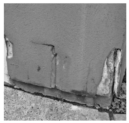
Impact damage that is not repaired promptly provides a pathway for leaks.

Although EIFS with drainage does address the water intrusion problems of face-sealed EIFS, it is not a foolproof solution. Should the vapor barrier or moisture retarder fail, water can still enter the wall assembly. Therefore, air and water barriers must be designed to last the life of the system.