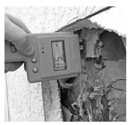
▲ Moisture meters may be used as part of an EIFS failure investigation.

Insulation board should not bridge expansion joints in masonry or concrete substrates. Instead, an expansion joint should be created in the EIFS insulation over the underlying joint.