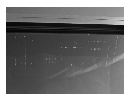
Scratches and hairline cracks.

Even fifty years ago, curtain wall systems weren't as energy-efficient as was solid wall construction. With energy costs and environmental considerations now topping the list of building management concerns, retrofits that increase the efficiency of glazed curtain walls have become an attractive option for improving overall building performance.