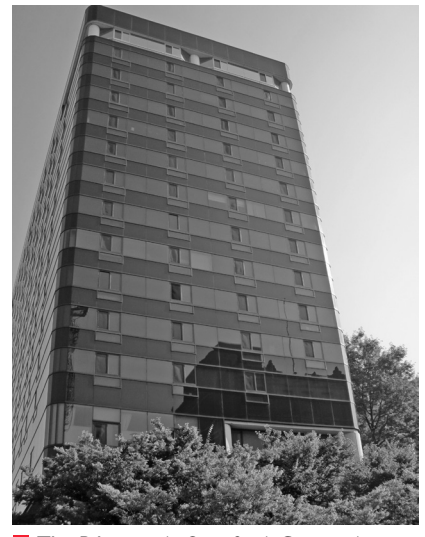
The Biltmore in Stamford, Connecticut. Glass Curtain Wall Rehabilitation Design.

New Haven, Connecticut Glass Curtain Wall Rehabilitation