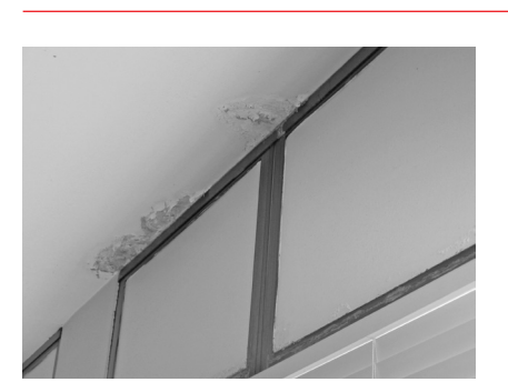
Leaks and drafts.