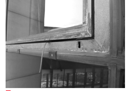
Loose or missing weather stripping.

without removing the glass. Wet sealing, which involves cutting out worm gaskets and adding perimeter sealant, may be an option; however, wet sealing does not generally result in a reliable water barrier, and it creates an ongoing maintenance demand. Where possible, it is best to maintain the original glazing system.