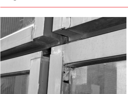
Gaps at frame corners.

Shrinking of neoprene exterior gaskets is a common concern, and it is not always easy to fix. Although some curtain wall systems, such as those that incorporate pressure bars, may permit gasket replacement without glazing removal, by and large it is difficult or impossible to replace gaskets