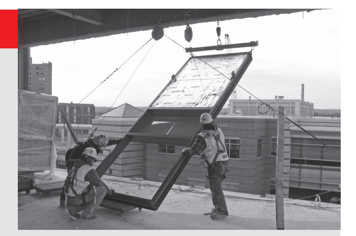
into sharp pieces, and many building codes limit its use in construction.

Annealed glass undergoes a controlled heating and cooling process that improves its fracture resistance. Despite its improved durability, annealed glass can break