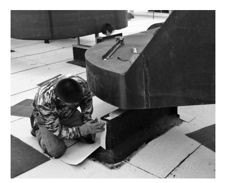
▲ Roof installation should be done only by manufacturer-certified contractors.