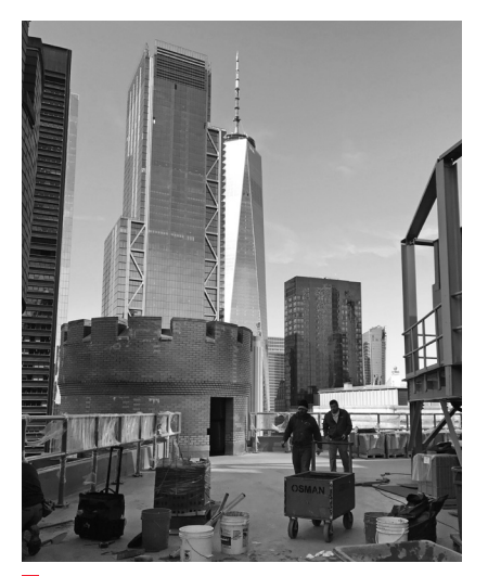
Not every roof is right for every building, so finding the best suited system is critical.

flashings. Failure to regularly inspect and maintain a roof can result in leaks, which may, in turn, void a warranty. Many warranties require yearly inspection and the regular performance of repairs to remain in effect.