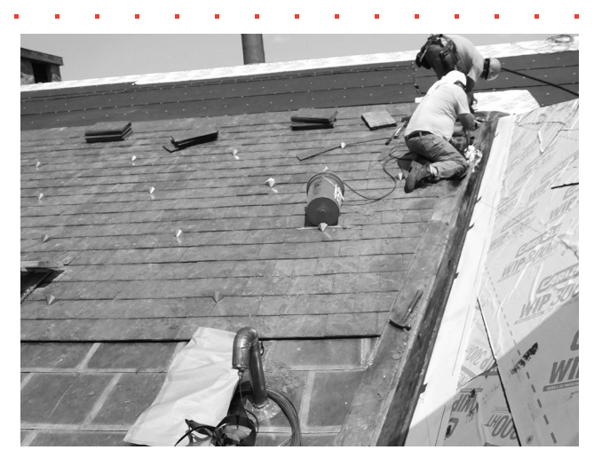
△ Details for penetrations, flashings, ridges, valleys, drainage, and other key components should be entrusted to an architect or engineer experienced with the specified assembly.

The first decision to make in the reroofing process is whether to tear off the existing roof and start from scratch, or to leave the old system in place and lay the new one on top. The