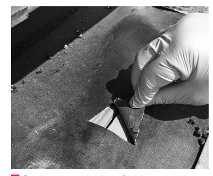
Recovering an old roof with a new one requires a sound roof deck.

best results are gained from complete replacement, as this not only eliminates the possibility of trapping moisture in the old system, but it also allows for a thorough inspection of the roof deck. Before the new system is installed, any deterioration in the substrate, such as rusted steel or spalled concrete, can be remedied.