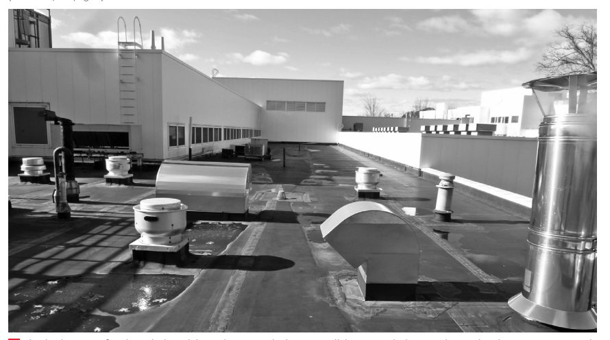
A design professional should evaluate existing conditions and determine whether a proposed new roof assembly is compatible with the building construction, climate, and wind zone.