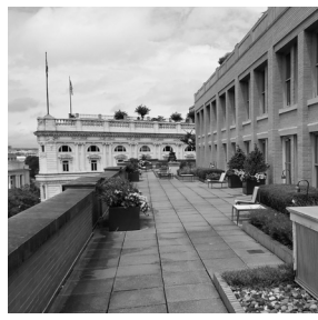
■ 1001 Pennsylvania Avenue, Washington, District of Columbia, Roof Replacement.