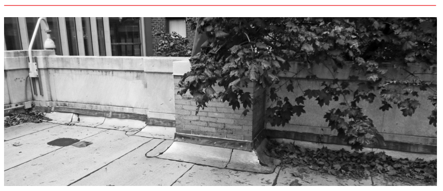
△ Cleaning up debris, clearing drains and gutters, and repairing damage from severe weather events are important maintenance measures, even for new roofs.

The National Roofing Contractors Association (NRCA) recommends maintenance and repair be performed at least twice a year as well as before and after severe weather seasons and events. Typical maintenance includes the removal of debris from the roof, drains, and gutters, and repair of any damage to roof coverings and