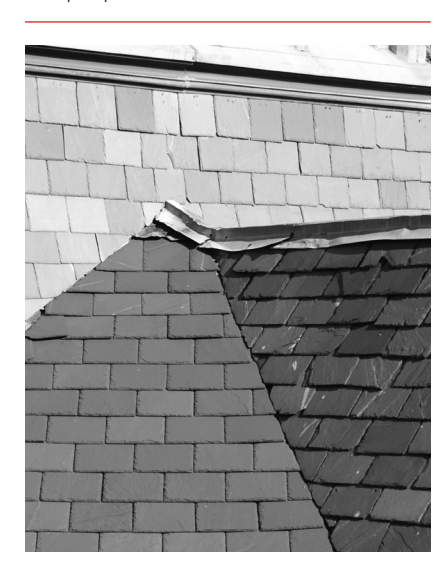
△ Pay attention to flashings, which can fail well before the roof needs replacement.

One would assume that the more insulation on a roof, the better it will perform. In fact, insulation beyond what is required can work in concert with the building's moisture drive to trap moisture under the roof and result in significant damage. Trapped moisture may cause a roof to warp or rot and can also allow for mold growth. Added insulation also impacts flashing and curb heights, and the increased weight of materials may pose structural concerns. The roofing design professional can review applicable building and energy codes to provide the proper amount of insulation.