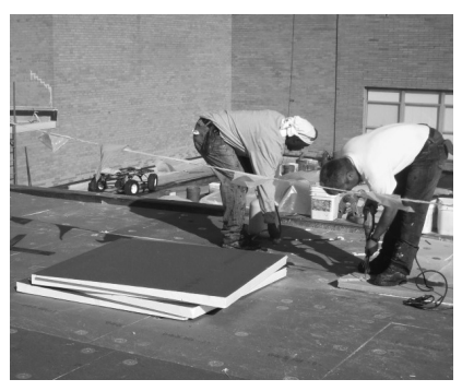
▲ Too much insulation can trap moisture and overload the building structure.