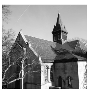
► Wellesley College, Houghton Chapel, Wellesley, Massachusetts, Slate Roof Survey.