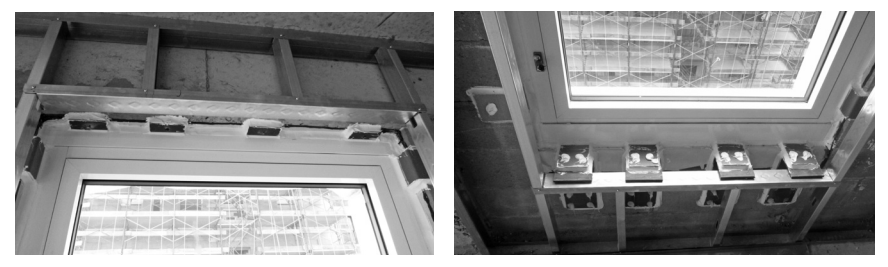
A High-efficiency details, such as warm spacers at window assemblies, prevent heat loss/gain by providing a thermal break at conductive materials, like metal-to-metal connections.

to dry, a semipermeable vapor retarder may be specified. In other cases, a system with very low permeance may be appropriate, so the architect or engineer should evaluate the building, climate, and situation and design accordingly.