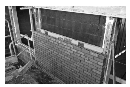
Air barriers require careful detailing at transitions and wall openings.

Design and installation of appropriate and comprehensive air barriers is mandated by the IECC (Section C402.5), which stipulates that air barriers must be continuous "throughout the building thermal envelope."To