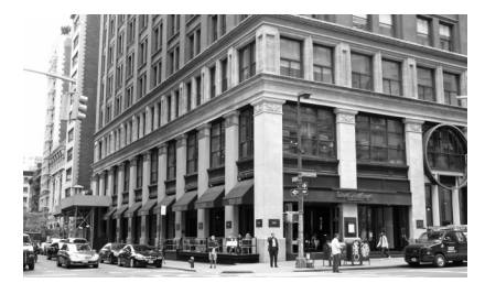
225 Park Avenue South, New York, New York, Building Envelope Consultation.

Litchfield Judicial District Courthouse Torrington, Connecticut Building Envelope Consultation