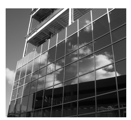
High percentages of glass require compensatory efficiencies in other systems.

Within a building, most heat accumulation attributable to radiation is the result of solar heat gain through the glazing. However, reducing the SHGC of windows is a trade-off, for as SHGC diminishes, so too does visible light transmission (VLT) , a measure of glass transparency.