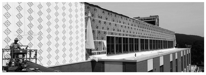
At the top level of this energy-efficient building, an adhered air barrier provides the primary weather protection for a metal panel cladding system, to be installed.

In the design and construction industry, it is now generally accepted that fully glazed walls are not necessary to achieve optimal daylighting or visibility. According to the United States Green Building Council's (USGBC) Leadership in Energy and Environmental Design