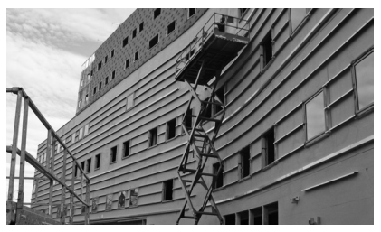
Municipalities may modify the IECC model code with more stringent requirements.

If high-efficiency enclosures are designed incorrectly, they can actually have an adverse impact on performance. Common issues include: