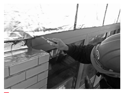
A technician repairs a penetration in an air and vapor barrier system.

Typically, such modeling follows the IECC methodology for the "Building Envelope Trade-Off Option," which enables designers to make up for inefficiencies in certain elements of the building enclosure (in this case, a preponderance of glass) through superior performance of other assemblies, such as opaque walls, roofing, or lighting. However, depending on how far the proportion of vertical fenestration exceeds the prescribed maximum, compensatory efficiencies in other building systems may become costprohibitive and/or not in keeping with design requirements.