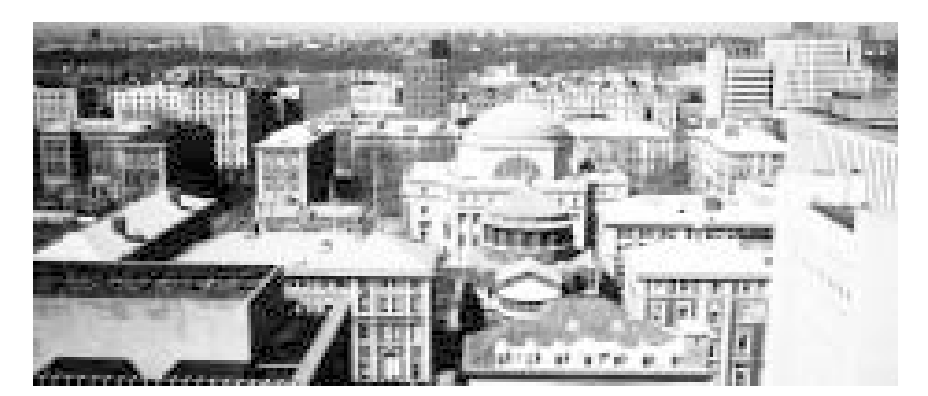
Columbia University Morningside Campus, 60 Buildings. Facade and Roof Investigation and Rehabilitation.

Southern New England Telephone Company Central Office Buildings Roof and Masonry Rehabilitation Various Connecticut Locations