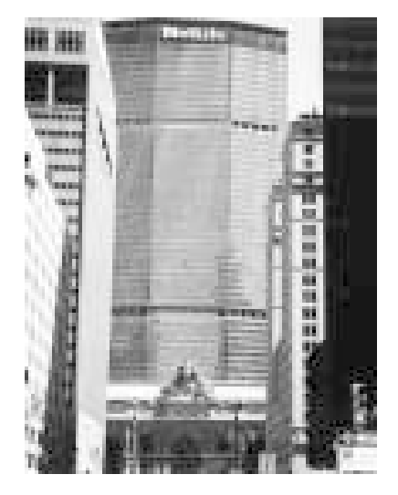
MetLife Building in New York City. Facade Condition Investigation and Rehabilitation.

University of Maryland Eastern Shore Physical Education and Health Center Roof Investigation Princess Anne, Maryland