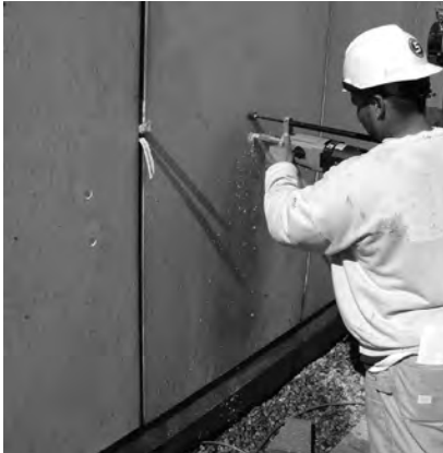
▲ Face-pinning is often used as a safety measure to prevent loose panels from falling.

Larger, continuous cracks should be evaluated on a case-by-case basis. Usually, face-pinning the stone and patching the crack is sufficient. However, multiple cracks on a single panel could be symptomatic of restraint and hysteresis stresses, which might require replacement of the panel and possibly the anchoring system.