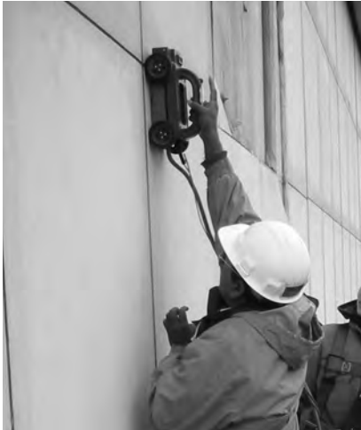
▲ Ground-Penetrating Radar (GPR) identifies anchor locations without removing panels.