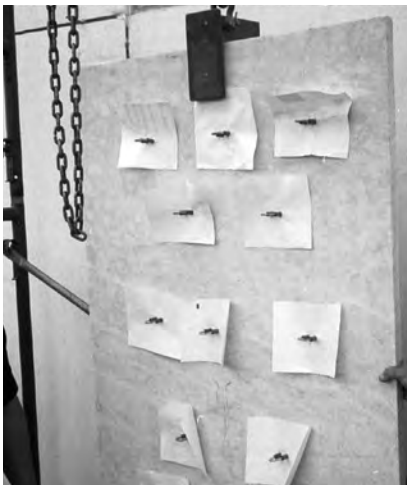
▲ Replacement panel mock-up to assess anchor geometry and installation protocol.