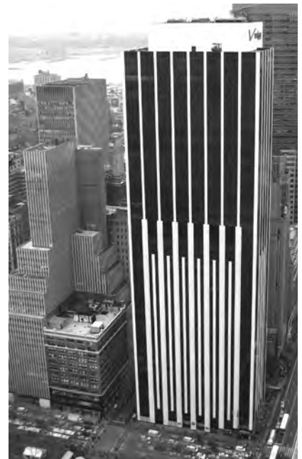
▲ Corporate High-Rise at 1095 Avenue of the Americas in New York, New York. Marble and Glass Curtain Wall Consultation.

Office Building 110 South Bedford Road Mt. Kisco, New York Marble Panel Facade Rehabilitation