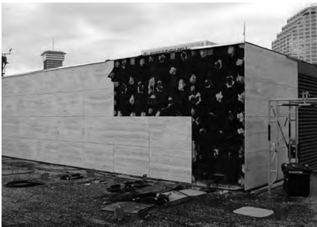
▲ Penthouse marble panel replacement in process.

periodically to minimize contaminants. Flexural strength tests may also be conducted, both for existing marble and to evaluate potential replacement stones.