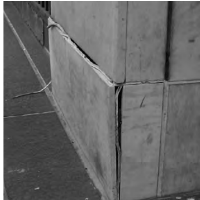
Sealant and anchorage failure

ally cut to a thickness of three or four inches. Developments in stone cutting allowed for ever-thinner panels, with the 1970s seeing marble as thin as a half inch. Lighter weight panels saved money in materials and installation, but brought with them new problems.