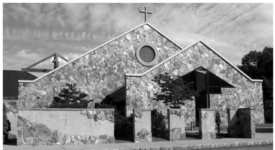
▲ Blessed Kateri Tekakwitha Parish in Sparta, New Jersey. Thin Stone Veneer and Roof Rehabilitation.