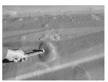
Recoating an existing roof that isn't watertight won't solve moisture problems.

Conservation Code (IECC) requires that roofs above cooled conditioned spaces in climate zones 1, 2, and 3 meet specified standards for solar reflectance, emittance, and Solar Reflectance Index (SRI).