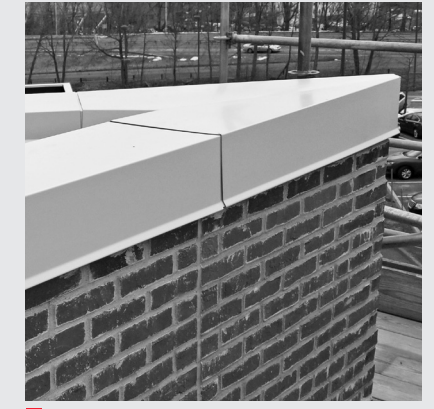
Parapet copings prevent water infiltration that can migrate under the roof membrane.