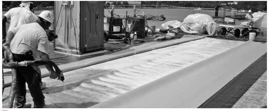
Installers apply spray adhesive for a single-ply assembly during a roof replacement project.