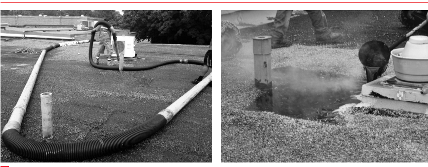
A Prior to installation of a recover system over an MBR assembly, loose granules in the existing cap sheet must be removed ( left ) or embedded in an asphalt flood coat ( right ).