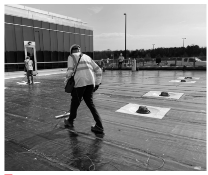
Electric leak detection is a non-invasive way to pinpoint breaches in the membrane.

a recommendation for pre-design. Replacement of drains, and addition of new drains, when necessary, requires access to the underside of the roof deck. Suspended or finished ceiling must be removed and reinstalled accordingly.