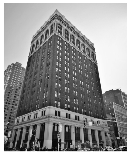
Masonic Hall, 71 West 23rd Street, New York, New York, Roof Recover System Investigation and Roof Replacement.

Brookfield Place, 200 Liberty Street New York, New York Roof Replacement for Conversion to Occupied Terrace