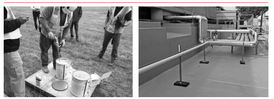
Two-component reinforced liquid resin recover systems, such as PMMA, cost more and require on-site mixing ( left ) but provide a seamless solution for complex roof areas ( right ).

Solar reflectance and thermal emit tance: The 2015 International Energy