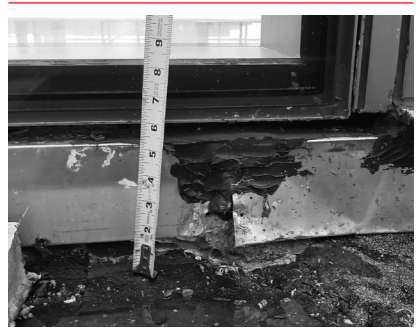
Low curbs and thresholds pose a challenge when insulation height must be augmented.

Following installation of the recover or replacement roof assembly, manufacturer maintenance guidelines should be provided to facility managers and ownership by the installers.