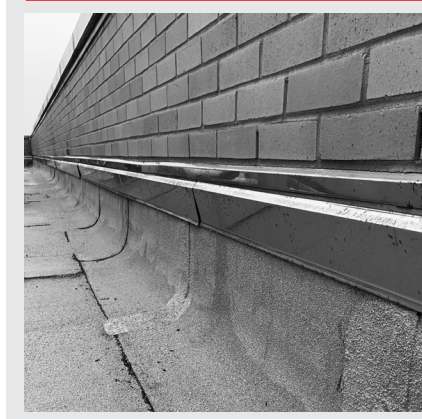
Metal counterflashing protects the upturned membrane edge at parapet walls.

Transition: Continuous air barriers are required by code for new construction. Providing laps between wall and roof membranes, in conjunction with through-wall flashings, meets this code requirement and helps to prevent energy loss and condensation risk caused by air infiltration.