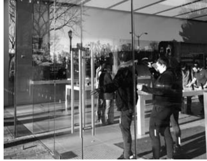
Without weatherstripping, these doors look sleek, but air infiltration may be an issue.

Particularly for historic storefronts or older assemblies suffering from deferred maintenance, it may be helpful to categorize problems by severity. Prioritizing repairs assists with budgeting, should the work need to be