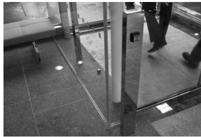
Vestibules prevent drafts and heat loss.