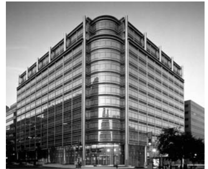
▲ 1900 K Street Office Building in Washington, District of Columbia. Storefront Revolving Door Assessment.

Starrett-Lehigh Building 601 West 26th Street New York, New York Consultation for New Storefront and Canopy at Landmark Building