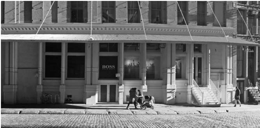
▲ Storefronts are the defining features of streetscapes and neighborhoods.

With the advent of architectural cast iron in the later part of the 19th century, combined with advances in glass manufacturing, storefront design was revolutionized. Slender metal columns and large areas of glass enabled shopkeepers to readily advertise their merchandise, with daylight reaching far into the space to illuminate the shop within. So began the modern commercial district: bright, expansively windowed storefronts collected along main thoroughfares, establishing what would become the central organizing feature of cities and towns.