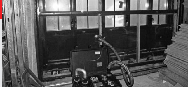
Field tests confirm the storefront meets performance standards.

Depending on the complexity of the design, the architect or engineer may recommend testing of the entire storefront system, including all components and glazing. The testing laboratory provides a basic structural skeleton, on which the contractor/installer builds the test specimen under the direction of the manufacturer. Since minor modifications are often necessary to pass the performance tests, it is important to have participation of the installer as well as all manufacturers, especially for custom assemblies involving parts from different companies.