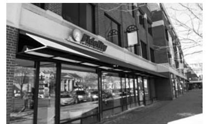
▲ Figure Eight Town Center in West Hartford, Connecticut. Storefront Consultation.

Hanover Insurance Group Headquarters Worcester, Massachusetts Glazing Replacement and Facade Restoration for Storefront and Windows