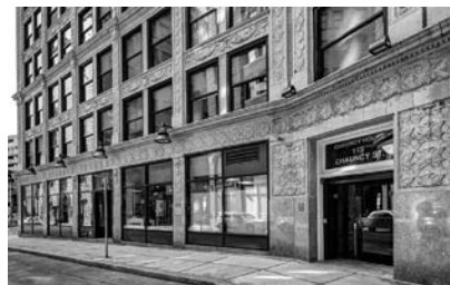
▲ Chauncy House in Boston, Massachusetts. Facade Restoration, Including Storefronts.

7W21 Flatiron Luxury Apartments New York, New York Building Envelope Consultation for New Construction, Including Storefront Entry