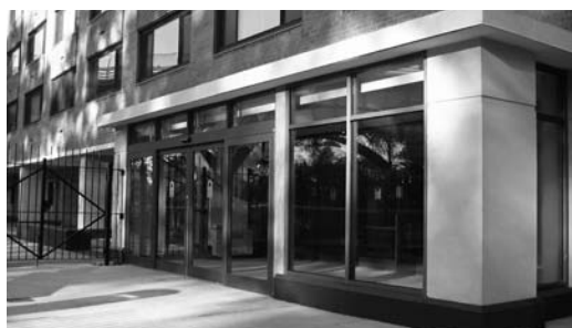
Replacement of this aging storefront ( below ) demanded modifications to the new assembly ( left ) for operation in strong wind.

When evaluating storefront design options, it is important to consider not only up-front cost, but maintenance and operation costs, as well. For example, a pivot door might be