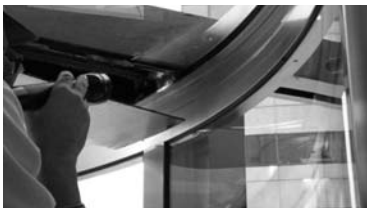
A Investigation of the poorly functioning revolving door at this office complex revealed extensive corrosion.

Conventional storefront systems are stick-built , constructed in the field from individual framing components