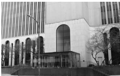
▲ M&T Bank in Buffalo, New York. Entrance Redesign and Plaza and Garage Rehabilitation.

Scholastic Headquarters New York, New York Storefront and Awning Conceptual Design for Landmark Building