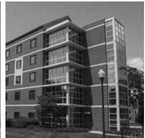
▲ Southern CT State Univ., West Campus , New Haven, Connecticut, Facade Consultation.

NYC Health+Hospitals/Kings County Brooklyn, New York Building Envelope Rehabilitation