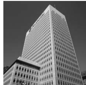
▲ Prudential Plaza Building , Newark, New Jersey, Marble Panel Facade Consultation.