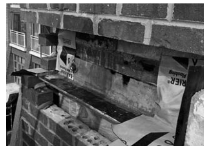
▲ Relieving angles and horizontal joints support masonry and allow for expansion.