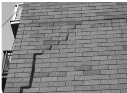
▲ Brick expansion leads to vertical and step cracking as forces seek pathways to relief.

Despite construction practices that limit shrinkage, expansion, bowing, and heaving, buildings will still move. Under restraint, the stress of tension or compression builds until it is released in the form of cracks, displacement, or breakage. Provisions should be made that allow the building to readily adapt to dimensional changes and the effects