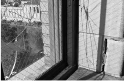
A Shattered glass and displaced concrete block due to building enclosure movement.

joint must accommodate. At corners, offsets, and setbacks in the facade, cladding materials like brick masonry will expand horizontally toward the corner, forming long, vertical cracks and displacement if expansion joints are not provided.