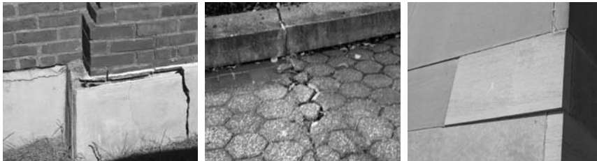
▲ Cracks at foundation-cladding interfaces (left), crumbling pavers at expansion joints (center), and displaced stone or masonry (right) point to insufficient provisions for material movement.

Periodic evaluation should aim to identify early warning signs of restrained movement, from longitudinal cracks at building corners to shifting of parapet walls, with a rehabilitation plan to rectify the condition before it becomes hazardous. For new construction, design should consider the anticipated behavior of all proposed materials in relationship to one another and to the environment, anticipating and allowing for dimensional and volume changes without compromising building integrity. ■