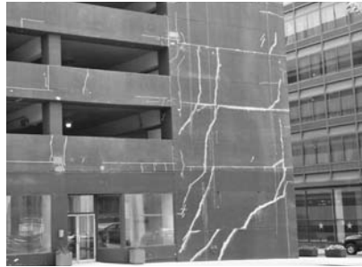
▲ Shear cracks riddle the exterior wall of this urban parking structure.