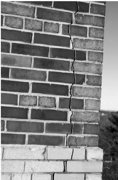
▲ If expansion joints are not provided, the building will make its own.

With attention to the causes of movement, including fluctuations in ambient temperature and moisture, applied loads, chemical interactions, and materials' propensity to expand or shrink over time, the general behavior