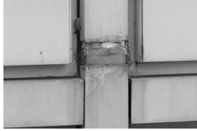
A Metal cladding displacement and exposure of underlying structural steel.

Each type of movement joint is intended to serve a specific function, so they may not be used interchangeably. Some, such as control joints, may be