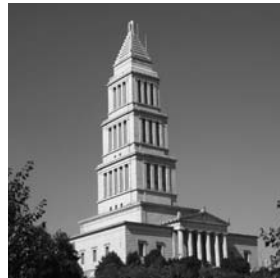
▲ Washington Masonic Memorial , Alexandria, Virginia, Earthquake Damage Evaluation.

Smithsonian Institution, Donald W. Reynolds Center for American Art and Portraiture Washington, District of Columbia Copper Roof Replacement