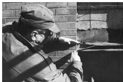
A Inadequate space for the steel relieving angle has caused this wall to bow outward.

Many brick masonry cavity walls use concrete block as back-up, a situation that leads to differential movement problems. After installation, brick tends to expand, while concrete shrinks. If the two are tied together rigidly, the wall will bow, deflect, and crack as brick and concrete pull against one another. Eventually, the ties binding face brick to concrete backup can break under strain, rendering the brick veneer structurally unsound and liable to fall from the building. Flexible anchors that can accommodate differential movement, in conjunction with sufficient cavity clearance, provide support