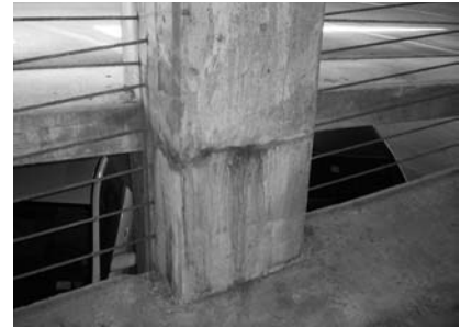
▲ At this garage, movement-related cracking worsened as embedded steel corroded.