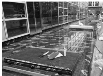
▲ After installation of new waterproofing, flood testing confirms water-tightness.