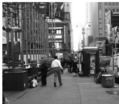
▲ Paramount Plaza, New York, New York, Pedestrian Tunnel Leak Investigation.