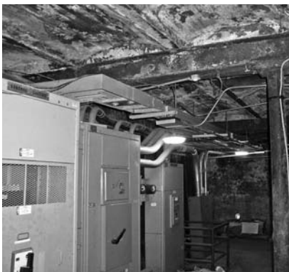
▲ Originally used for coal, sidewalk vaults may house mechanical/electrical equipment.

To determine the load capacity of the vault and evaluate structural integrity, the design professional performs tests and analysis that assess the ability of the structure to provide the requisite