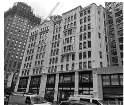
▲ Open Society Foundations, New York, New York, Sidewalk Vault Rehabilitation Design.