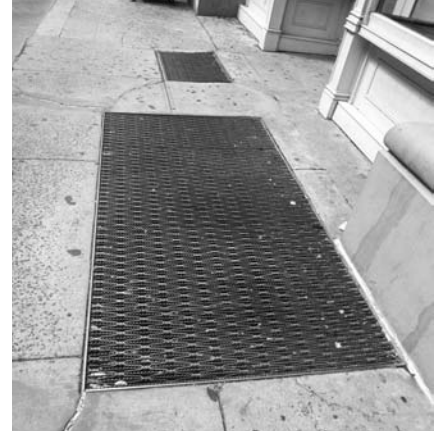
▲ Falling into a faulty grate is a real concern.

Although it's true you'd be more likely to be hit by a car than fall into a sidewalk grate, a “better safe than sorry” approach might be prudent, given how commonplace deferred maintenance can be. Just as you wouldn't step in front of a moving car even if you had the right of way, it's probably not a bad idea to avoid traversing flimsy metal mesh over a two-story drop. Our engineers will not walk on these grates. Now that you know what the engineers know, you might want to join them in taking the long way around – just in case. ■