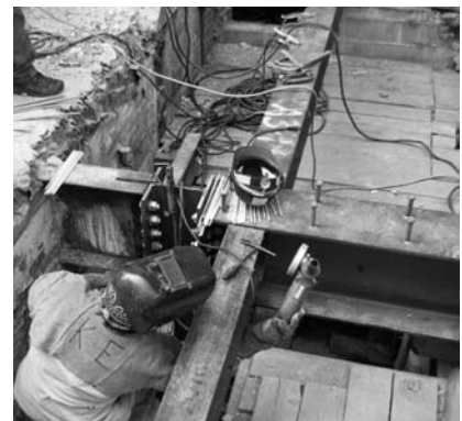
▲ Replacing or reinforcing structural steel may be necessary for today's traffic loads.