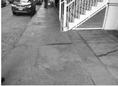
▲ Massive granite paving slabs typify sidewalk construction in historic SoHo, New York.