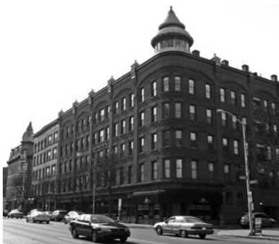
▲ One Linden Place, Hartford, Connecticut, Electrical/Boiler Room Vault Rehabilitation.

101 Barclay Street New York, New York Sidewalk Replacement and Waterproofing