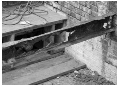
▲ Removal of masonry arches uncovers severely deteriorated structural steel beams.