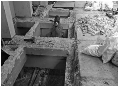
▲ Concrete sidewalk and slab are removed to access the vault below.