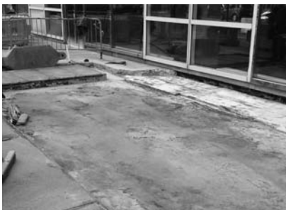
▲ First, the concrete wearing surface is removed to expose the concrete vault.