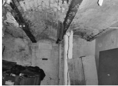
▲ Masonry arches with steel beams comprise the sidewalk vault structure.