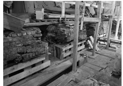
▲ Temporary stabilization of brick masonry permits replacement of deteriorated steel.

code, supplemental structural support may be necessary.