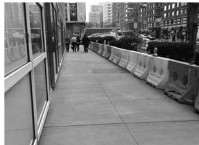
▲ The completed sidewalk system protects against water infiltration into the vault below.