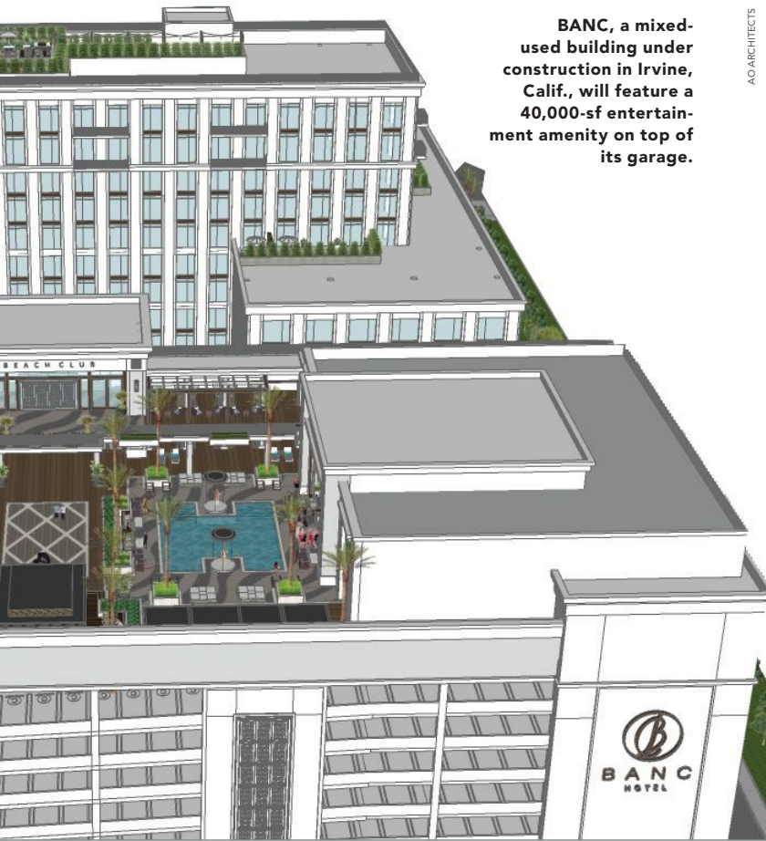
BANC, a mixed-used building under construction in Irvine, Calif., will feature a 40,000-sf entertainment amenity on top of its garage.