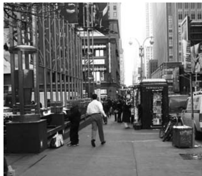
▲ Paramount Plaza, New York, New York, Pedestrian Tunnel Leak Investigation.