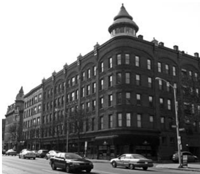
▲ One Linden Place, Hartford, Connecticut, Electrical/Boiler Room Vault Rehabilitation.

101 Barclay Street New York, New York Sidewalk Replacement and Waterproofing