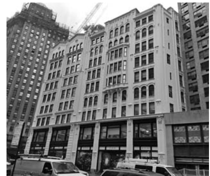
▲ Open Society Foundations, New York, New York, Sidewalk Vault Rehabilitation Design.