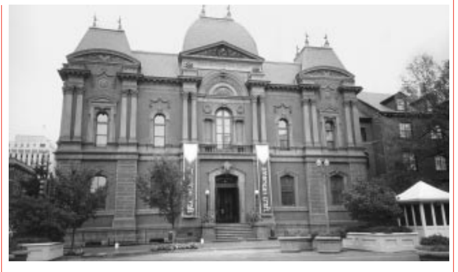
The Renwick Gallery, part of the Smithsonian Institution's National Museum of American Art in Washington, DC. (1859-61 James Renwick, Jr.)

The firm is there to see the project to a successful completion.