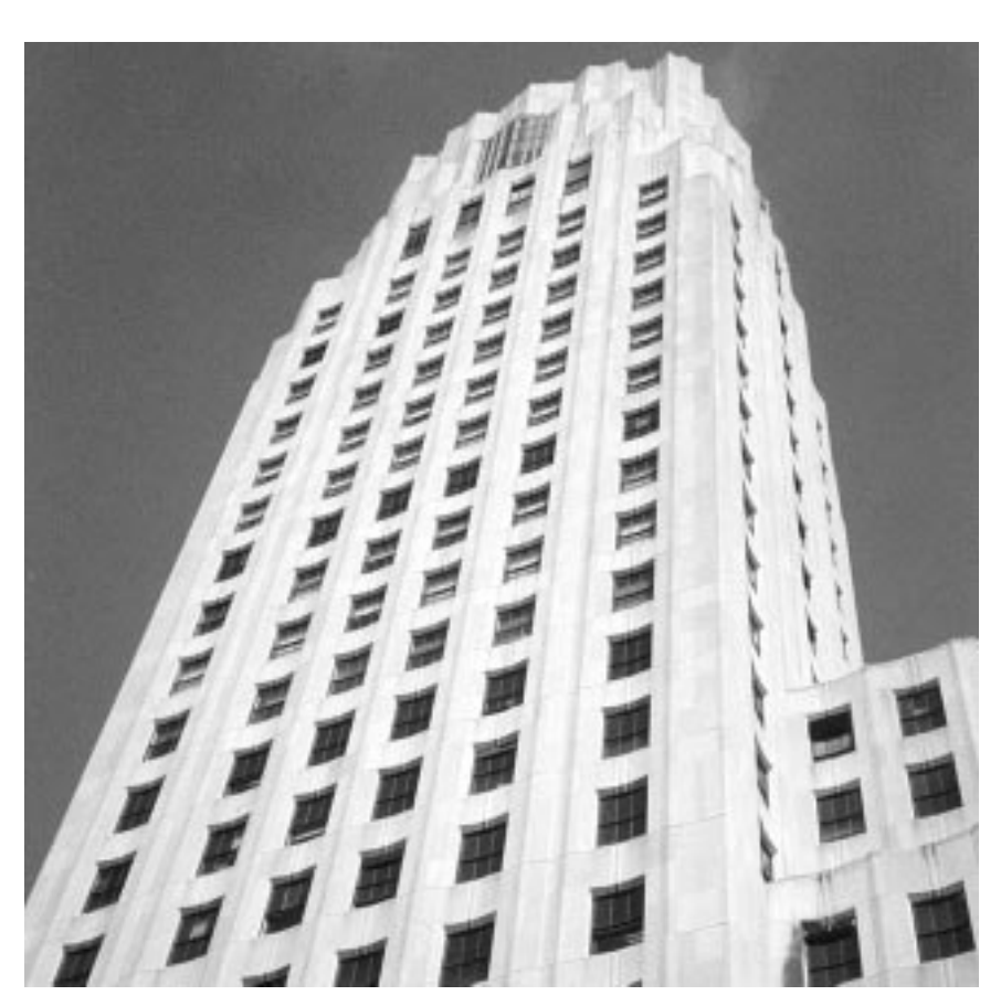
The master plan for this Art Deco landmark included masonry and roofing restoration, and rehabilitation of the 1,500 deteriorated steel windows.

The Bank of New York knows a thing or two about finances. So when it came time to address facade rehabilitation issues on their 52-story New York City headquarters at One Wall Street,