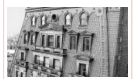
The Guardian Life Insurance Company headquarters in New York City. (1911 D'Oench & Yost)

Commitment to the historic or landmark building doesn't end at the drawing board. Hoffmann Architects offers full construction administration services to ensure that all work is carried out according to design, as well as to respond to last-minute changes.