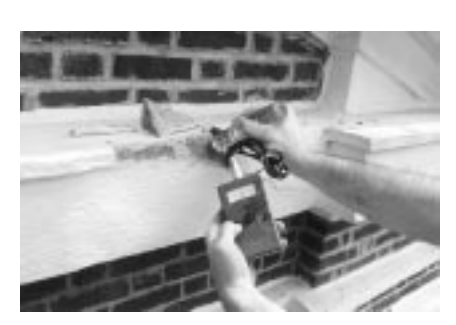
Determining the moisture content of subsurface masonry is a frequently used investigative method that can help identify the integrity of back-up materials.

The goal of this investigation is to design a plan of attack for building rehabilitation and maintenance. After drawings and construction documents have been examined, probable deterioration causes and underlying problems have been assessed, and