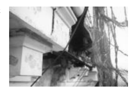
As an emergency measure, netting was installed on this severely deteriorated, 80-year-old cornice to prevent loose materials from falling.

Once investigative work has been completed, stabilizing the structure should be top priority. Any hazardous conditions identified during the