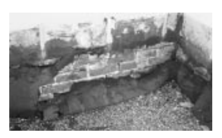
This repair effort used roofing cement to seal over a leaking brick parapet wall — a solution that instead trapped moisture within and caused further deterioration.

In order for contractors to competitively bid and correctly implement the selected rehabilitation methods, documents and specifications must be created which offer a clear picture of the needed solution. While an investigation is important to survey existing conditions, identify emergency situations, and prioritize rehabilitative work, the report produced does not provide the level of detail necessary to ensure appropriate methodology.