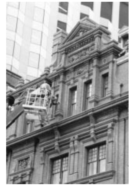
Paul C. Lanteri, AIA investigates masonry deterioration at the turn-of-the-century Goodwin Hotel in Hartford, CT.

The first step for the design professional is to research and evaluate the original construction documents and records of earlier repairs, surveys, and building alterations. One key to understanding the problems affecting a structure — and to designing the right solution — lies with learning how the building was constructed.