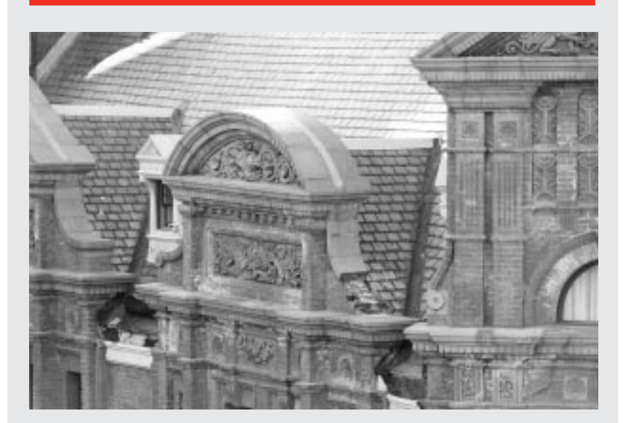
Intricate brick work and thin mortar joints necessitate clear construction documents and innovative methods to achieve rehabilitation.

To resolve the problem, Hoffmann Architects specified replication of the brick pattern at the areas of reconstruction, while bonding the face brick to the interior masonry with a series of stainless steel strap anchors custom-fabricated for this project. To meet the re-pointing challenge, the firm specified a custom mortar mix, which improved upon the strength of the original mortar while still maintaining its flexibility. The specifications also called for the combined use of hand and power tools to remove the existing mortar, to fill the joints, both injection and traditional jointing tools and trowels were indicated. \blacksquare