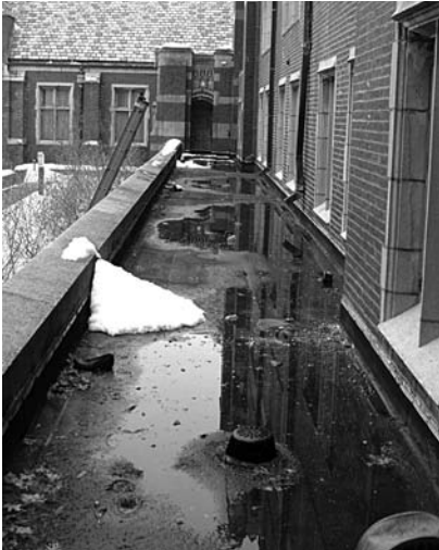
A Ponding water on roof setback.