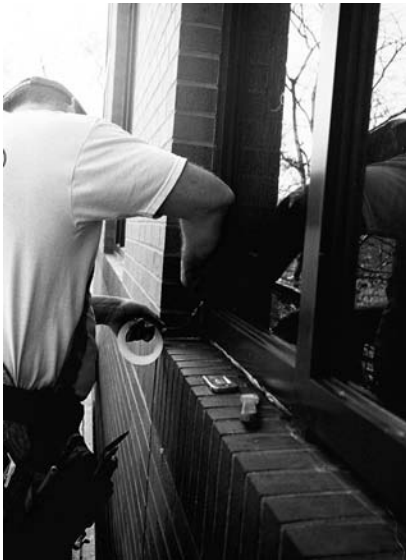
▲ Seal doors and windows well ahead of winter weather.

If you do not already keep a maintenance and repair record, establish