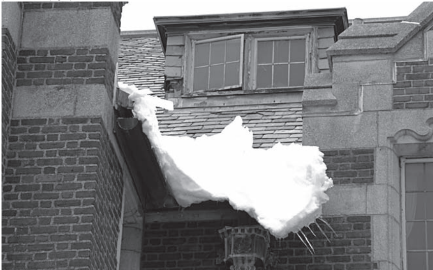
▲ Ice dams pose serious hazards and, over time, lead to roof damage and leaks.