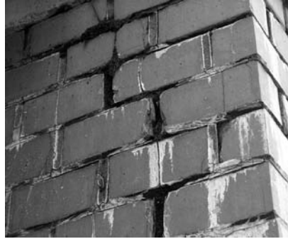
▲ Cracks and eroded mortar compromise resistance to ice, snow, and changing temperatures.

If you have ruled out drainage and water penetration problems, but large concrete members continue to show surface moisture, then you might have a simple case of seasonal condensation. Make observations during different weather conditions; condensation is likely to appear when weather heats up quickly, as during an unseasonably warm winter's day or early spring thaw. There may be little that can be done about the problem, however, as it is simply the nature of a large mass to warm up more slowly than the surrounding air, leading to water