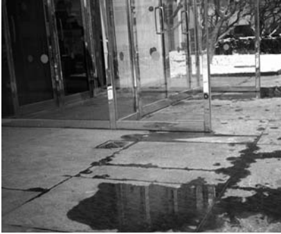
▲ Fix drainage problems promptly , before icy patches create liability risks.

there, or to move it to a single area of the parking deck, which would then be closed to use. If the latter is the case, then be sure that the structure can accommodate the load of the mounded snow.