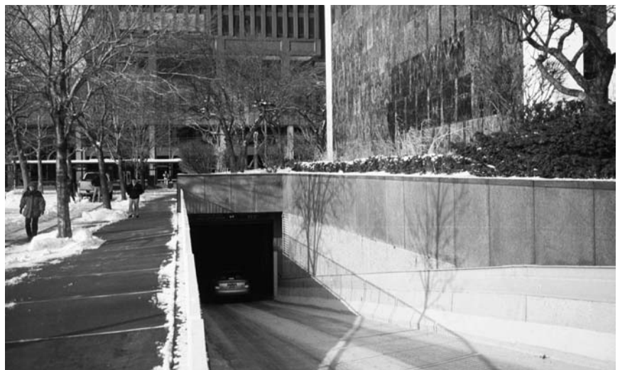
▲ One M&T Plaza in Buffalo, New York. Investigated and resolved chloride-induced corrosion at parking garage and plaza.

New York, New York Addressed differential settlement due to freeze/thaw cycling at plaza; remediated leaks and deterioration at facade