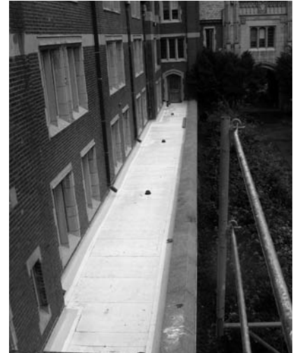
A Properly designed roof.

a Winterizing Program document that you can use to collect and store information on maintenance evaluations, planning, repairs, and methods. Record your observations about roof conditions, using photographs and sketches, and list needed repairs so that these can be scheduled and completed before the cold weather.