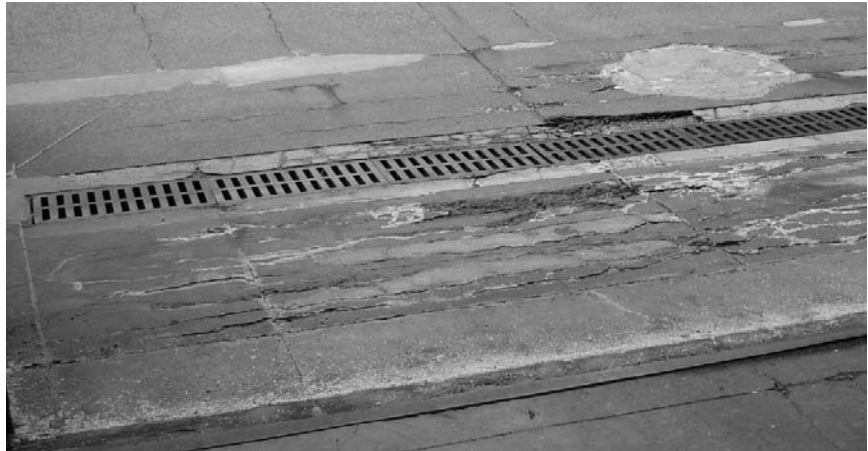
▲ Steel plow blades can cause substantial damage, particularly at drains, joints, and transitions.

The best approach, then, is to stop this cycle of damage before it gets